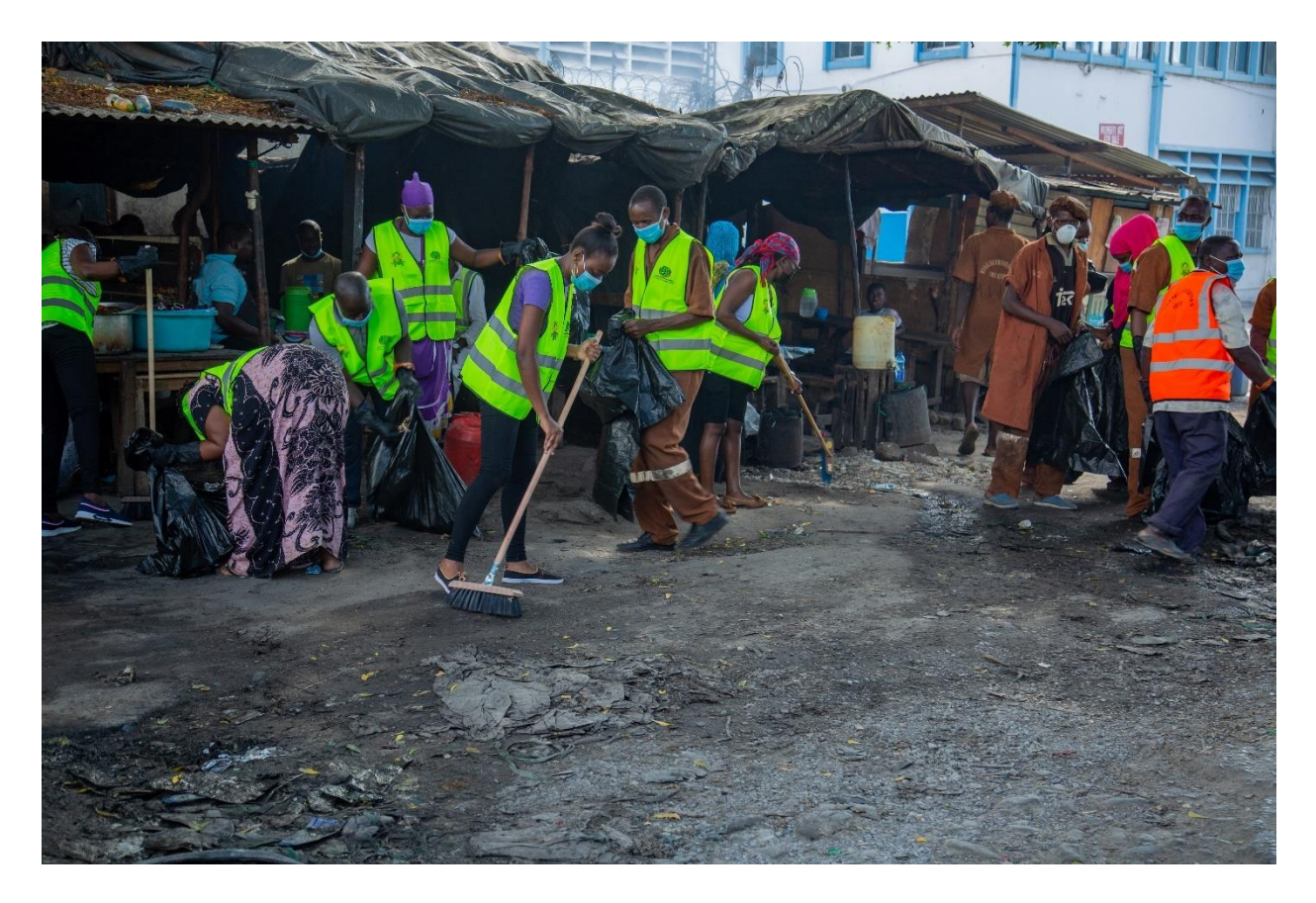
Figure 9 A combination of our staff, the occupants of the informal eating establishments, as well as the Community Health Volunteers clean up a section of the street