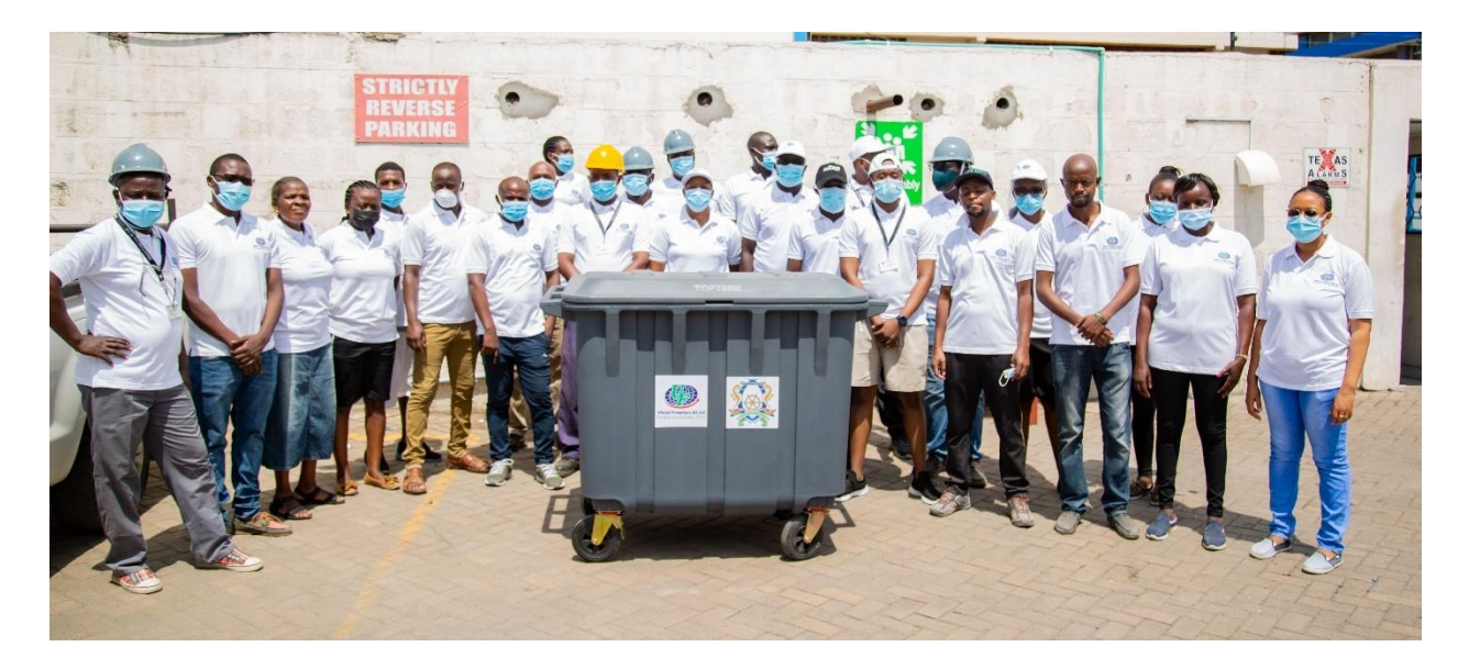
Figure 7 Staff pose next to 1 of the bins we donated during the Clean-Up Exercise