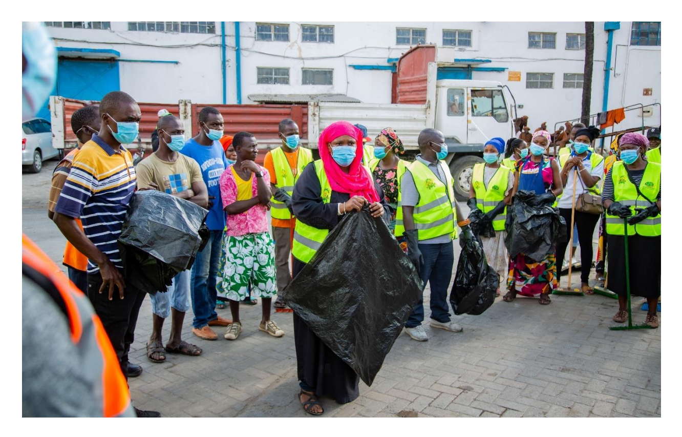
Figure 10 A Public Health Official demonstrates how to categorize the different waste into different colored bin liners