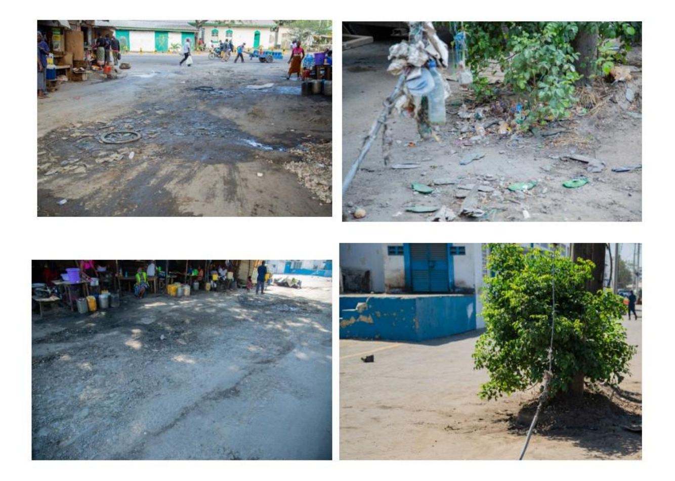
Figure 12 Sections of the street before and after the Clean-Up