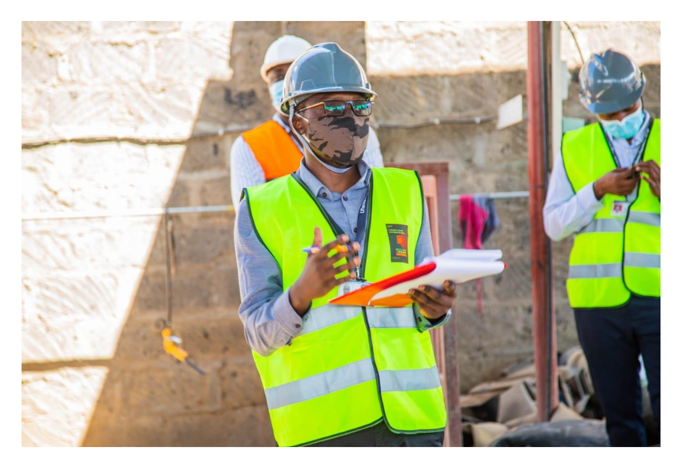
Figure 4 A staff member sensitizes staff on the importance of the World Health and Safety Day