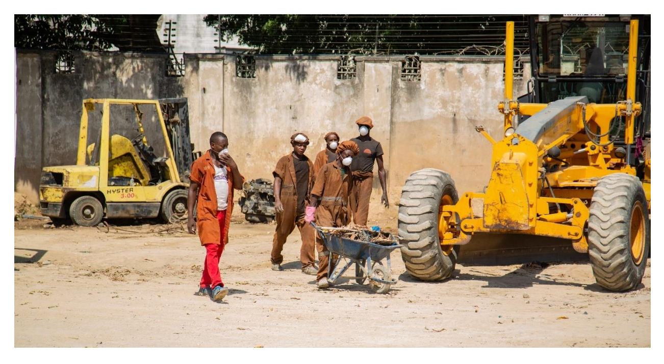
Figure 8 A group of our casual staff assist in cleaning the inside of our yard as part of the Clean-Up Exercise