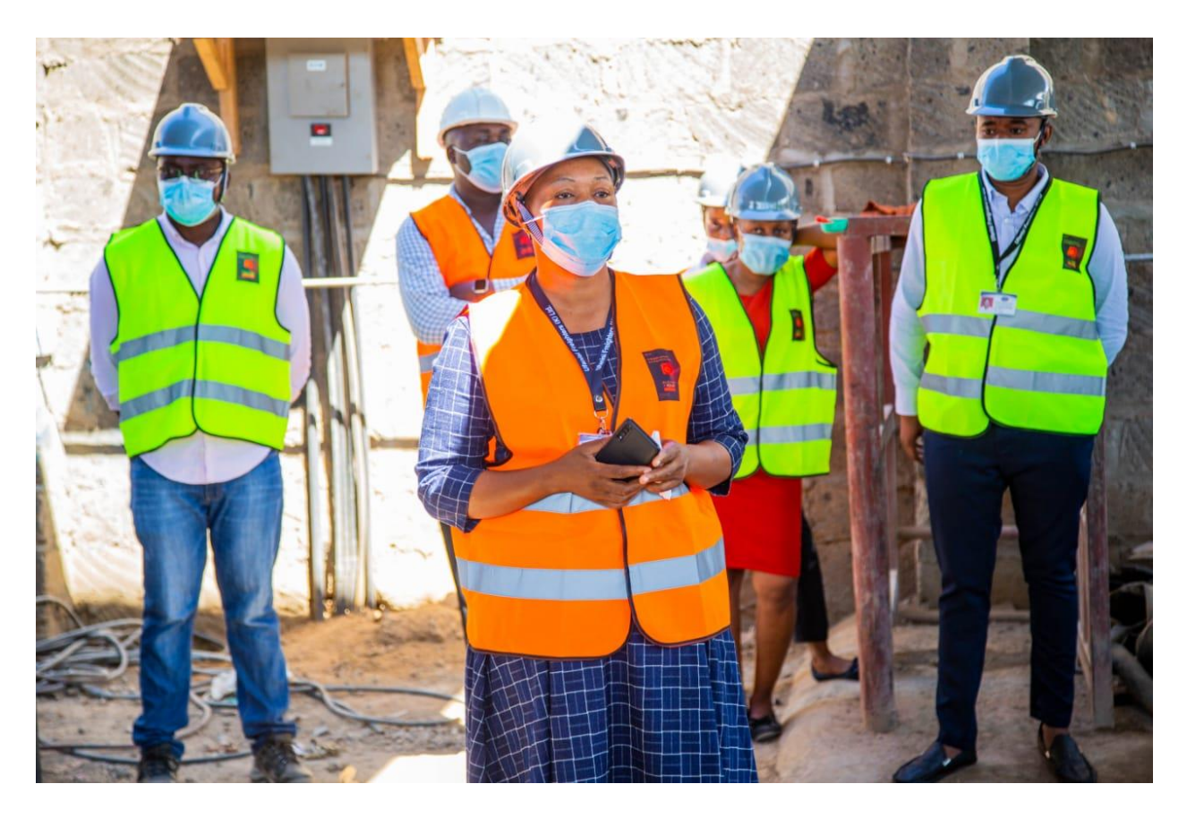
Figure 5 Staff pay attention to the ongoing Sensitization Exercise by the Public Health Official