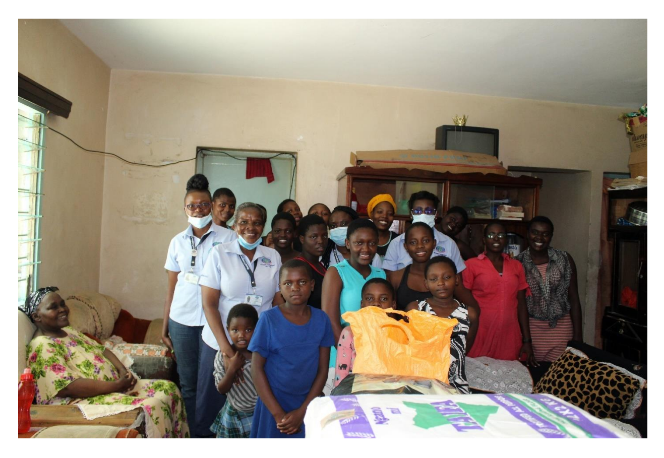
Figure 2 Staff take a picture with the children at one of the children's homes we visited during the 2020 Customer Service Week celebrations

donate food items, items of clothing, and monetary contributions to alleviate the effects of the harsh economic times made even worse by the onset of the pandemic.